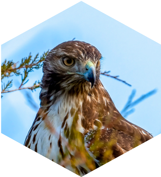
Red-tailed Hawk: Barland Kitts

A mostly cloudy day posed some lighting challenges for 6 attendees that Wednesday morning. “Silhouette Birding” was kind of the name of the game for a while as we got started. Ring-necked Ducks dominated the water scene and were among 9 species of waterfowl observed (including what turned out to be the highlight of the day – three scruffy looking Ruddy Ducks in the mix). Others commanding the group’s attention were a preponderance of White-throated Sparrows and one beautiful Brown Creeper spiraling around and down to the bottom of the tree that it was working on, showing off its snow white underbelly. 33 species were observed and the group looks forward to next month’s trip to Greenfield, hoping to find even more winter waterfowl. Please join us!